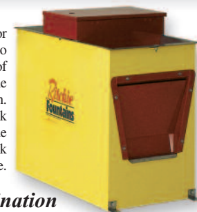
3 Combination 16769

If you're looking for an efficient way to water animals of different sizes, try the Combination Fountain. Large animals drink from the top while small animals drink from the side.