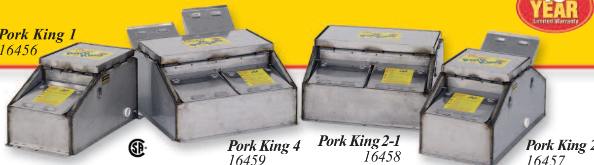
Pork King 4 16459