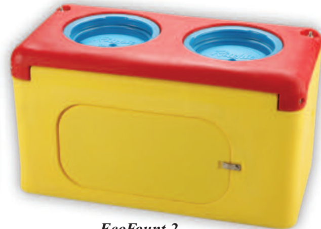
EcoFount 2 18440