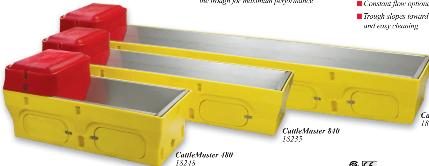
CattleMaster 480 18248