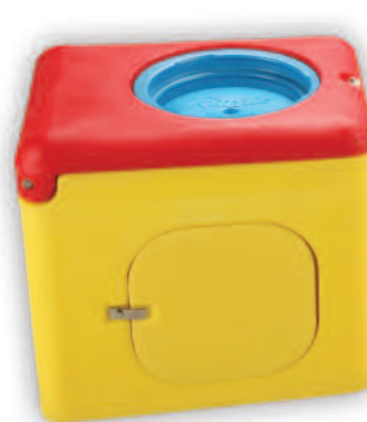
EcoFount 1 18430