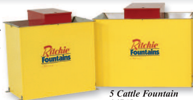
5 Cattle Fountain 16745

If you're looking for an efficient way to water animals of different sizes, try the Combination Fountain. Large animals drink from the top while small animals drink from the side.