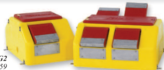
Thrifty King HG2 16259